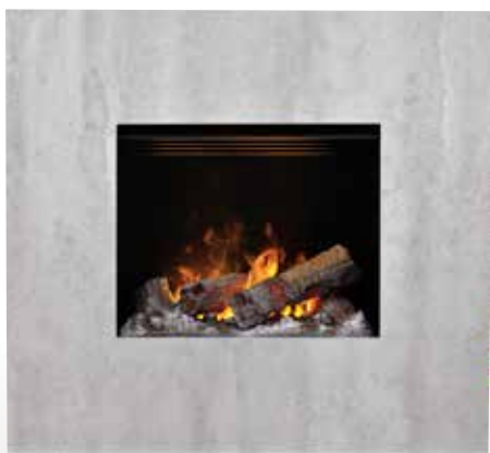
Nissum concrete S 207821 / 5011139207821