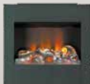
Nissum Concrete L Wall fire engine L 210203 5011139210203