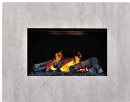
Nissum concrete L 207838 / 5011139207838