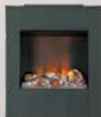
Nissum Concrete S Wall fire engine S 210180 5011139210180