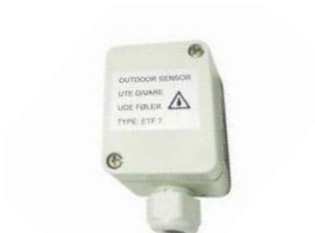
■ ETF-744/99 Sensor External air sensor