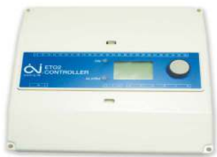
■ ET02-4550 Controller Up to 48 Amps