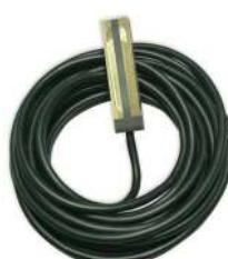
■ ETOR-55 Sensor Gutter sensor