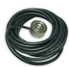
■ ETOG-55 Sensor Ground sensor