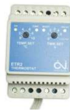
■ ETR2-1550 Controller Up to 16 Amps