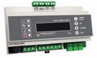
■ HCC-01 Controller Up to 48 Amps