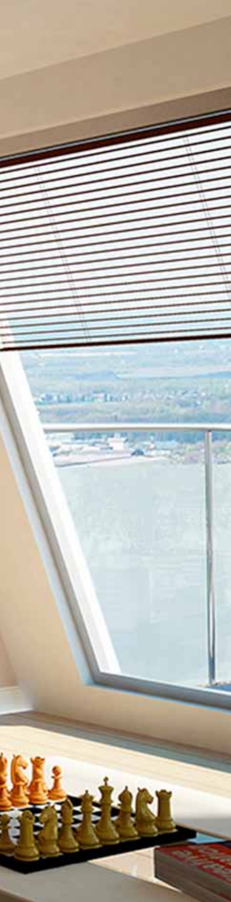
SRX180BG in contemporary black glass finish. Pipework is hidden by through the wall plumbing connections.

An added benefit of SmartRad is that it allows flexible left or right handed plumbing connections, or even 'invisible' through the wall connection, offering complete flexibility over installation, particularly in retrofit situations.