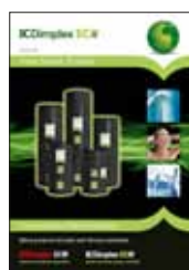
EC-Eau Cylinder brochure