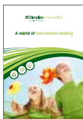
A world of low-carbon heating