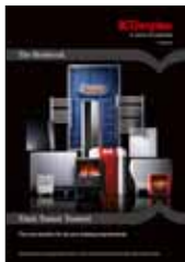
Domestic heating brochure