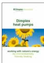
Heat pumps brochure

Please visit our website www.dimplexrenewables.co.uk for more information.