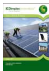
Solar PV brochure