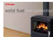
Solid fuel brochure

For more information on our wide range of renewables technologies, please visit www.dimplexrenewables.co.uk