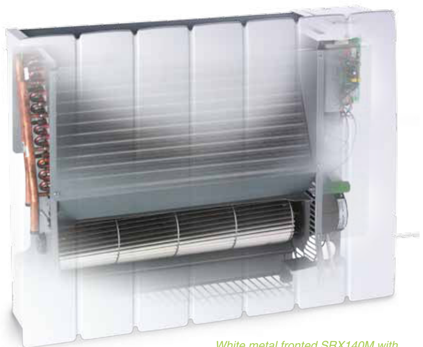
White metal fronted SRX140M with left hand side plumbed connections.