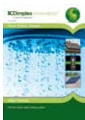
Solar Thermal brochure